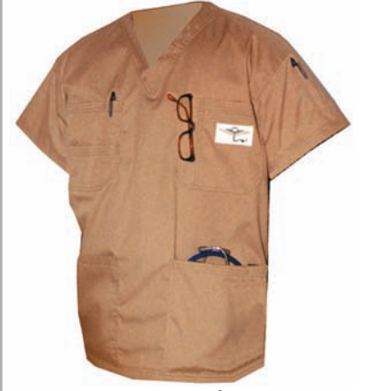
Trauma Shirts For Special Pocket Needs