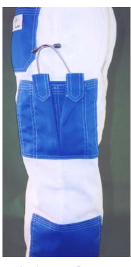
Aviator Pants w\Zipper